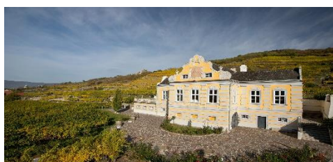
BAROQUE CELLAR PALACE